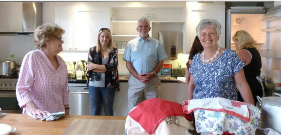
The catering crew who produced a fabulous lunch!