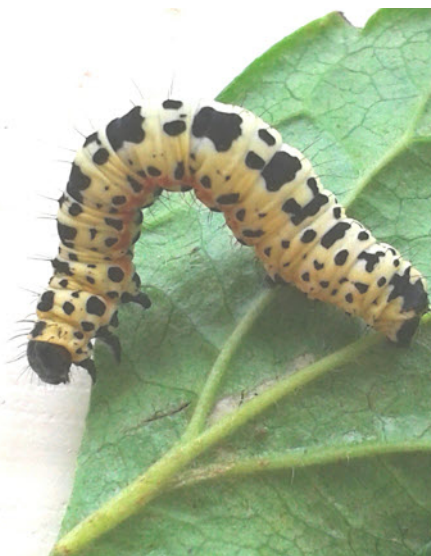
Caterpillar of the Magpie Moth

If you would like to join us/ find out more do come along to one of our sessions on a Wednesday at 10:00 and a Sunday at 2:00 or contact one of the team listed at www.wot2grow.co.uk