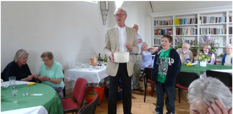
Drawing the raffle.